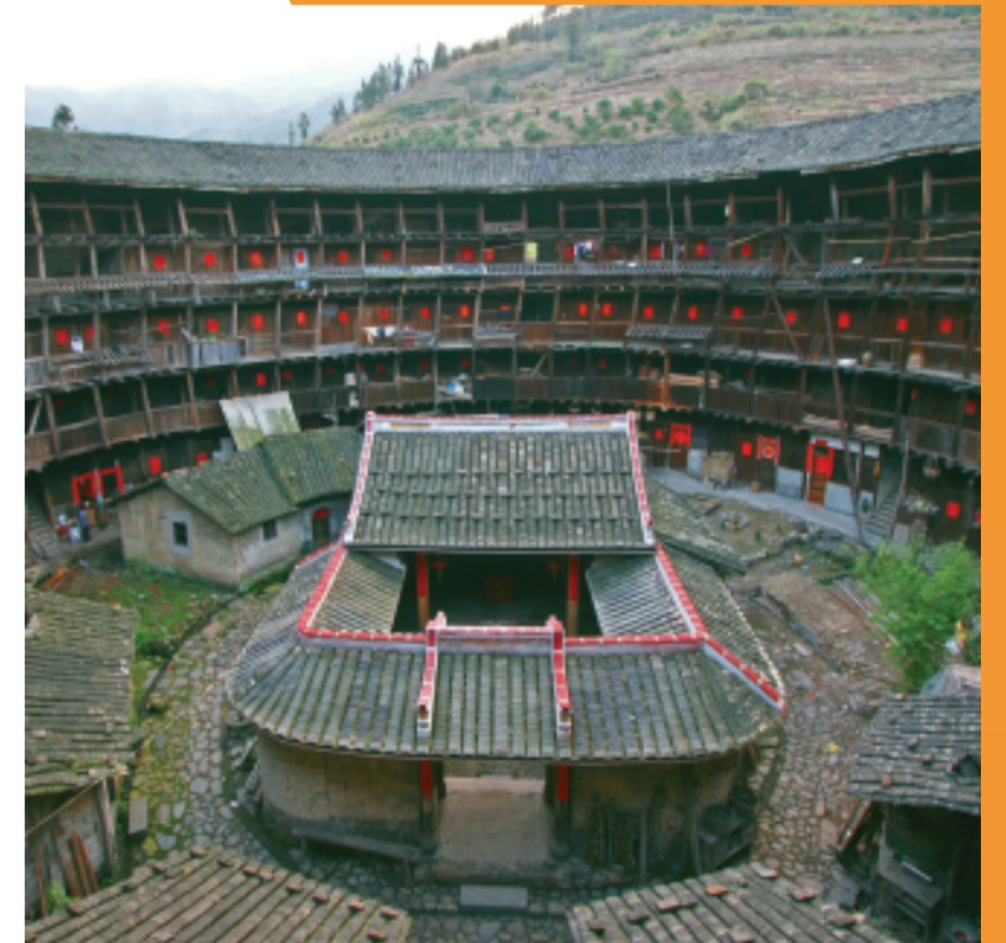
At left: The California Academy of Sciences, San Francisco, California 2008. Image courtesy of Renzo Piano Building Workshop.