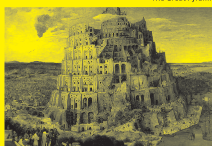
Tower of Babe