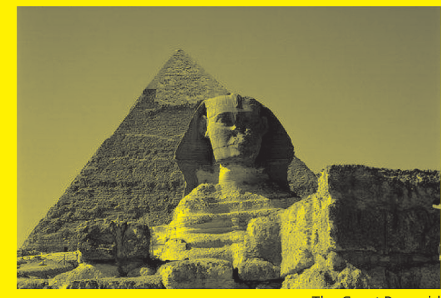
The Great Pyramid