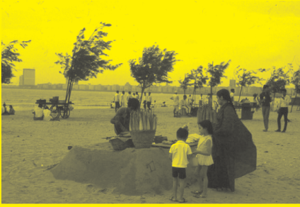
Chowpatty Beach, Bombay