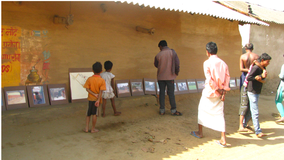
Fig.3: Public display of architectural photographs and drawings in villages as part of PhD fieldwork in March 2013.